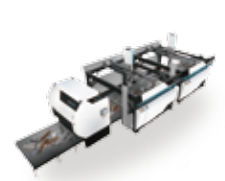
ZenRobotics Recycler ZRR